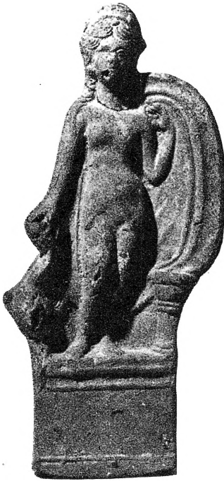
Fig. 4. Thessaloniki museum no. 2956