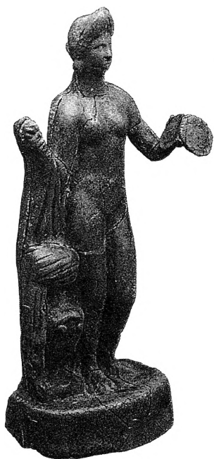
Fig. 6. Thessaloniki museum no. 2931