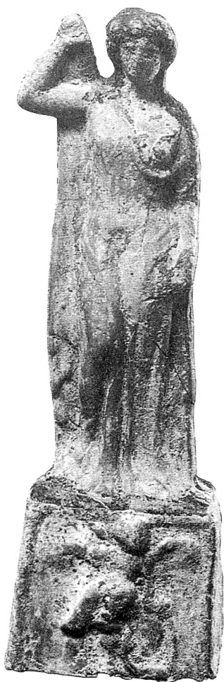
Fig. 1. Thessaloniki museum no. 10263

i) a naked figure with the body bending sharply to the left and a dolphin between the legs covering the pubis with its tail; 3 (Fig. 2)