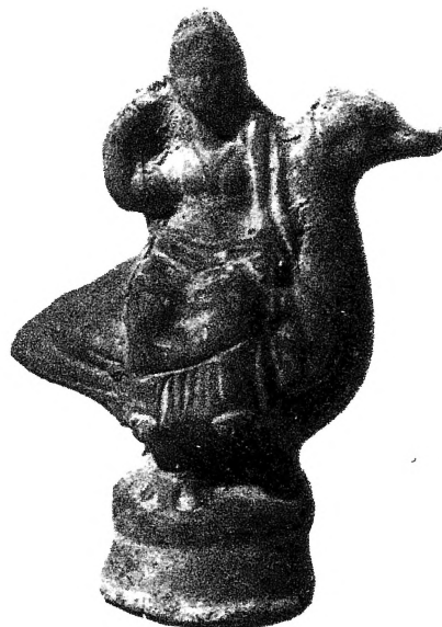
Fig. 7. Thessaloniki museum no. 3036

goose that walks towards the right. The figure wears a chiton and a himation, which also covers her head, from which she draws it with her right hand. The goose is on a round base. There is no doubt that the figurines of female figures astride birds represent Aphrodite, and this is anyway confirmed by the inscription on Pistoxenos' kylix with the same subject. 13 The anakalyptomene gesture is also characteristic of Aphrodite. 14