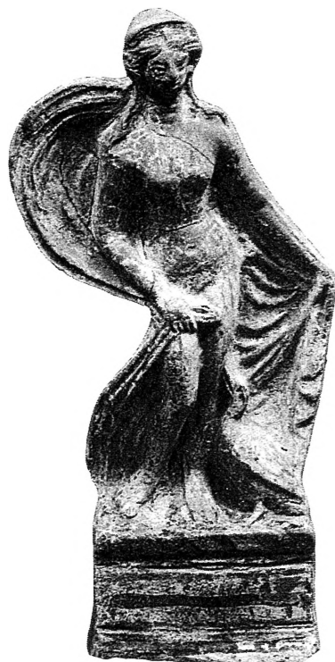
Fig. 3. Thessaloniki museum no. 6322

Figurines of the Aphrodite of Knidos are the most characteristic group in Thessalonian koroplastics, for in them we can detect three generations of figurines that are